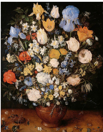
Bouquet, 1599 Jan Brueghel the Elder