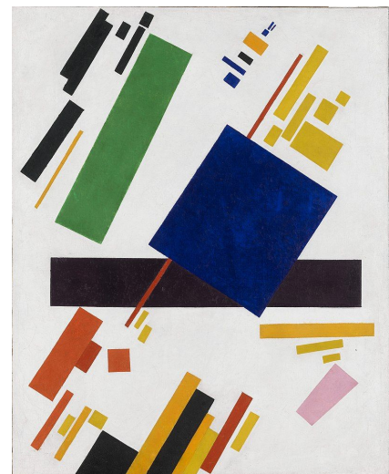
Suprematist Composition, 1915 Kazimir Malevich