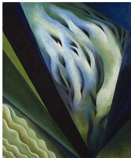
Blue and Green Music, (1919–1921) Georgia O'Keeffe